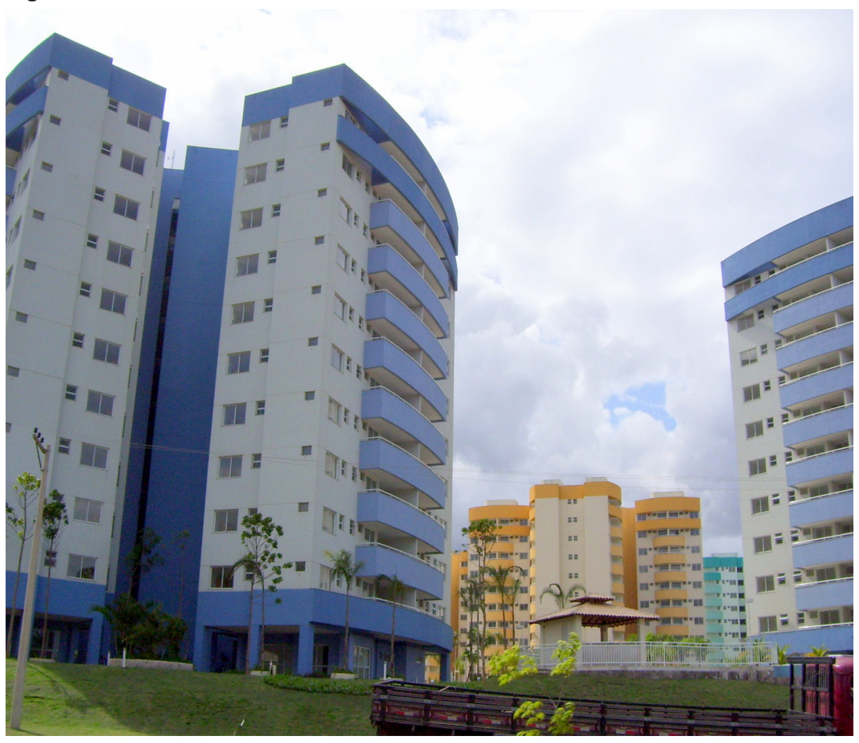
Figure 1: Vila Panamericana

Source: (C) Artur Jacob, licensed under Creative Commons License Attribution-Generic 2.5 (CC BY 2.5). Photo resized to fit portait orientation.