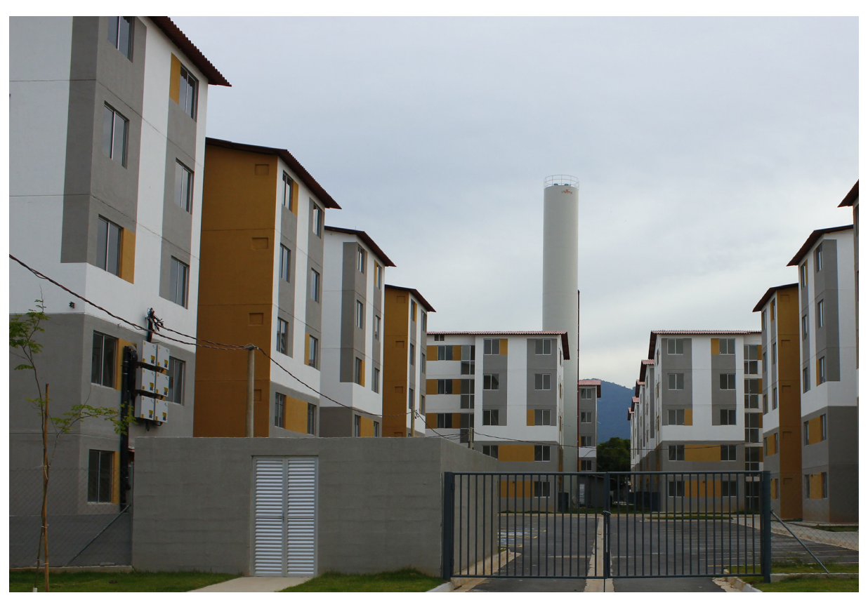
Figure 2: Parque Carioca